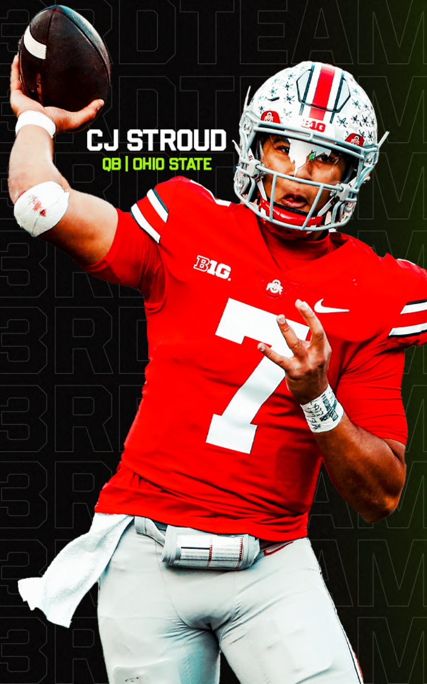
CJ STROUD QB | OHIO STATE