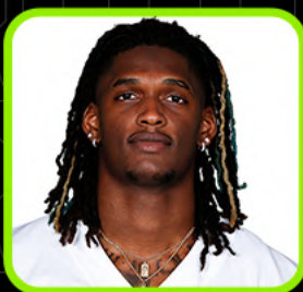
ELITE CEEDEE LAMB

18+ PPG: 0 16+ PPG: 1 14+ PPG: 2 12+ PPG: 3