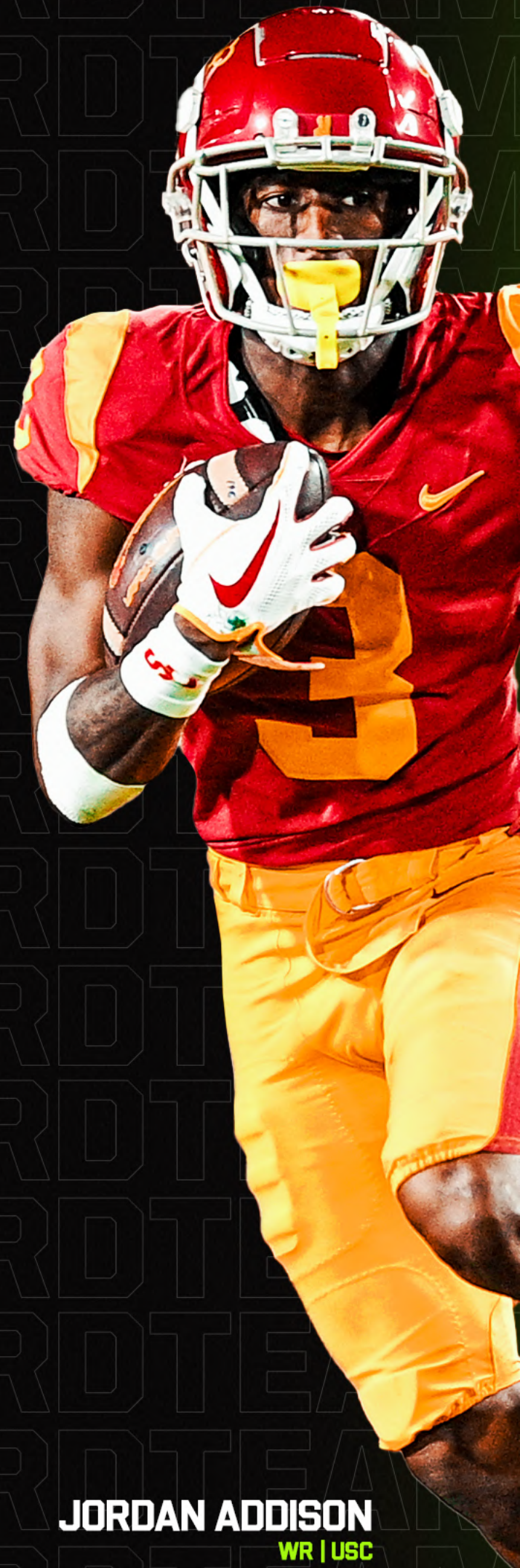
JORDAN ADDISON WR | USC