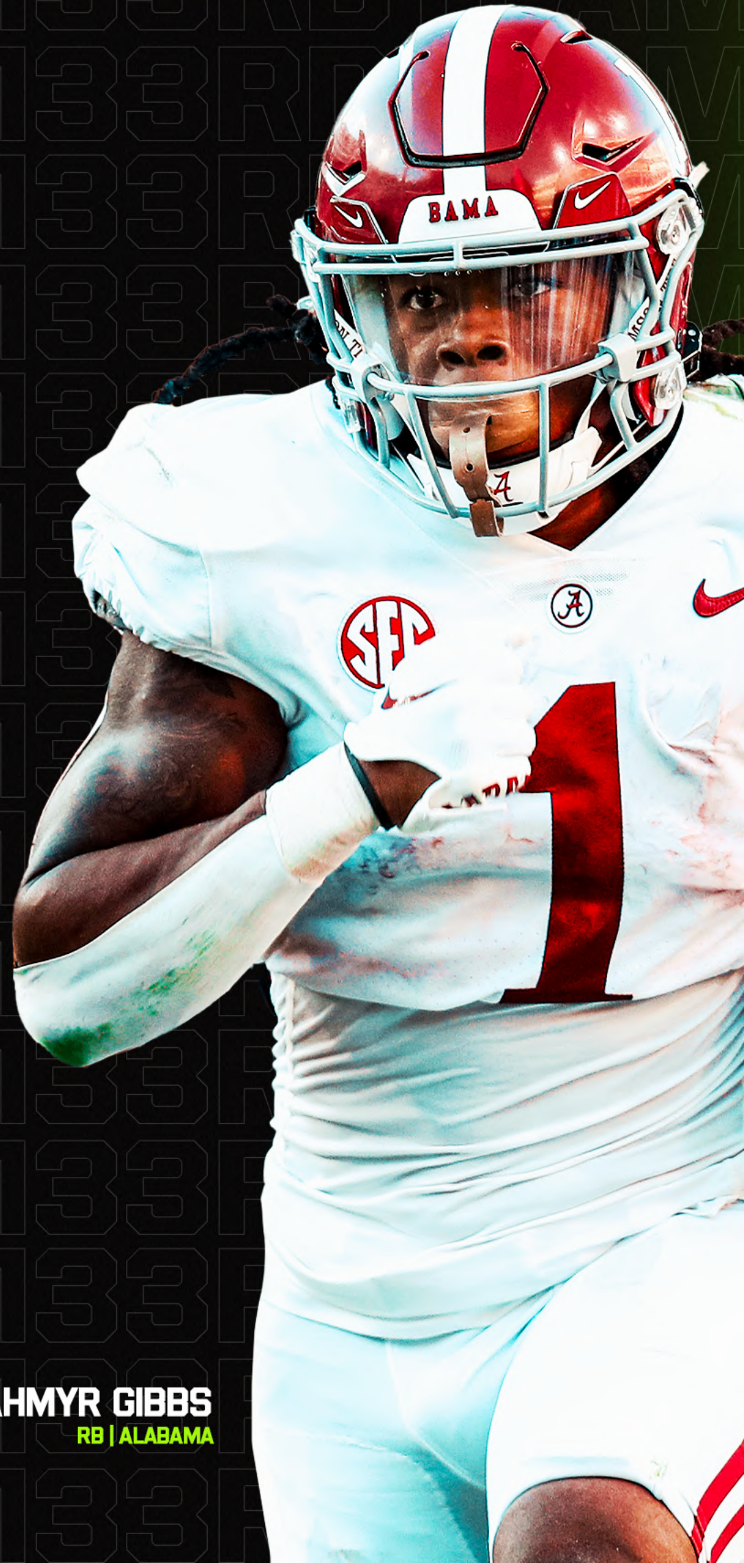
JAHMYR GIBBS RB | ALABAMA