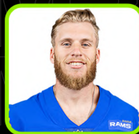
ELITE COOPER KUPP

18+ PPG: 2 16+ PPG: 4 14+ PPG: 4 12+ PPG: 5