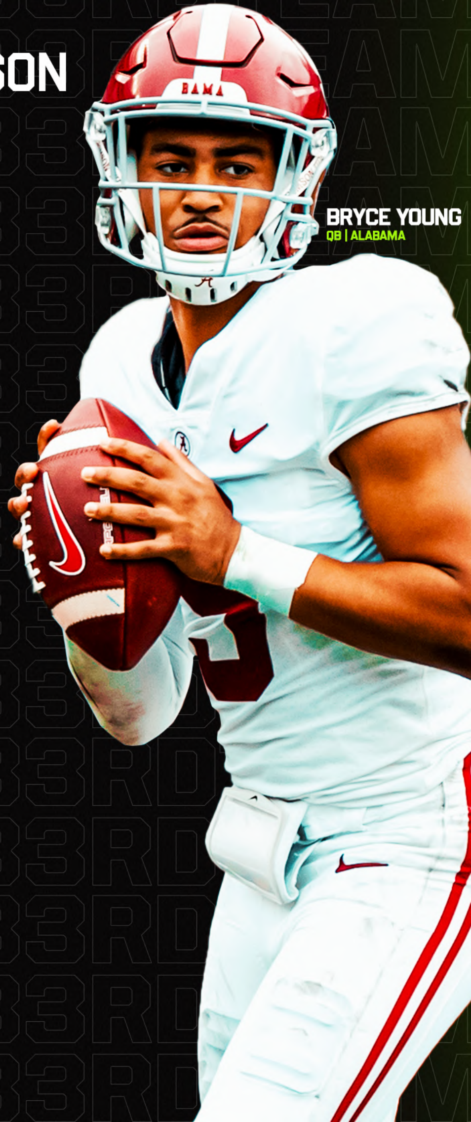
BRYCE YOUNG QB | ALABAMA