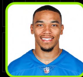
ELITE AMON RA ST.-BROWN

18+ PPG: 0 16+ PPG: 1 14+ PPG: 1 12+ PPG: 2